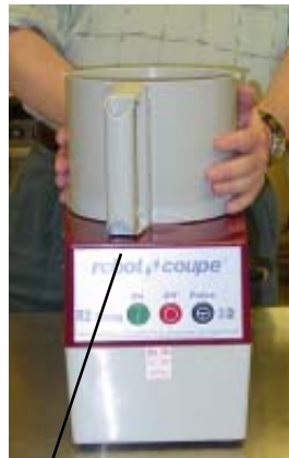
Step 2: Rotate bowl counter clockwise until handle is centered in front.