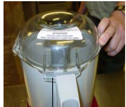
Step 5: Twist slightly counterclockwise until tab slides into safety lock position. Now the unit can be started.