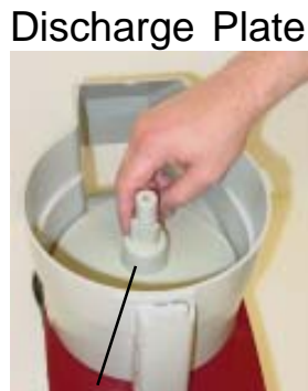
Step 3: Turn Discharge Plate until it drops.