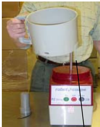
Step 1: Place bowl over motor shaft positioned with handle slightly to the left.