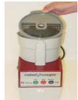
Step 4: Place Dicing Grid with tab facing rear of machine.