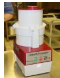
Step 10: Properly Assembled R2Dice with Continuous Feed Attachment. Now the unit can be started.