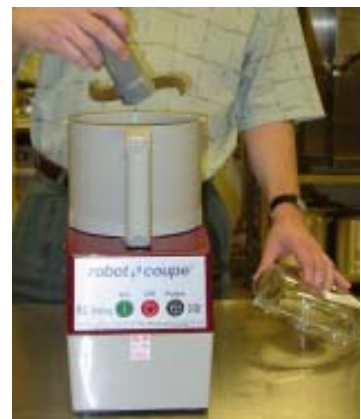
Step 3: Place "S" Blade on motor shaft inside bowl and spin counter clockwise until it locks in place