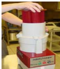
Step 9: Place Pusher Assembly into half moon slot of Top half of Feed Lead.