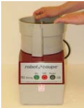
Step 1: Place Feed Lead Base slightly left of center and turn right