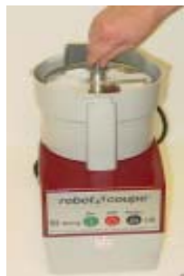
Step 6: Tighten Screw Assembly by Turning Clockwise until snug but not locked.