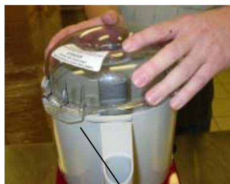
Step 4: Place Bowl lid on with largest tab on Bowl slightly to the left.