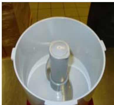
Properly assembled "S" Blade Placement