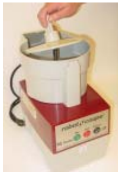
Step 2: Place Discharge Plate on Motor Shaft.