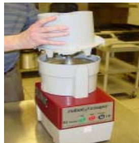
Step 7: Place Top of Continuous Feed (making sure the tabs are inside the feed lead base) slightly left of center and turn right locking it in place.