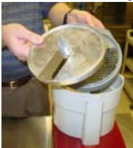
Step 5: Slicing Disc is installed over Dicing Grid