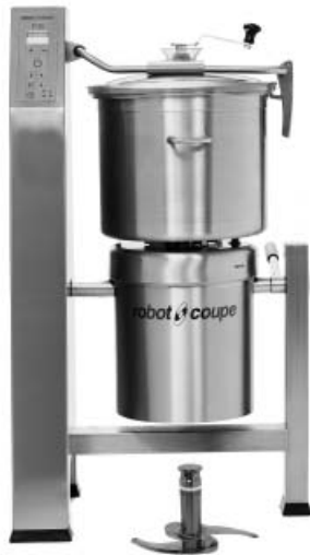
Blixer® 45 - 47 Qt. Capacity