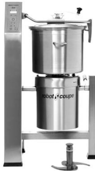
Blixer® 60 - 63 Qt. Capacity

Designed for Vertical Cutting and Mixing: Mix, Chop, Puree, Blend.